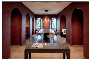
Reference clinic REHAB CENTER in Camden Medical, Singapur

We, the MedTec from Wetzlar, are proud of the successes we have achieved together with Pharmatech and are looking forward to the continued prosperous cooperation in Asia.